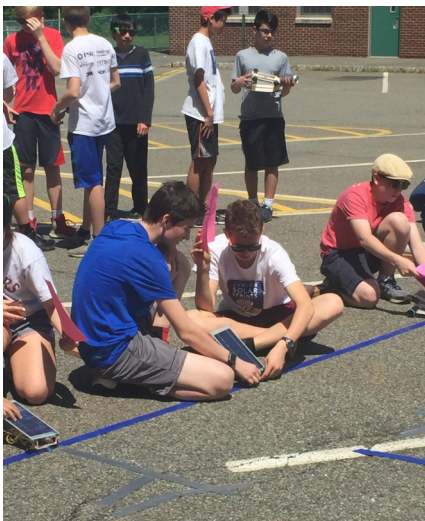
Two groups from Memorial Junior School's Technology Club participated in this year's TransOptions Junior Solar Sprints Inter-County Finals at Ridgedale Middle School in Florham Park on Monday, May 21, 2018. Out of the teams who made the finals, the two teams from MJS finished 6th and 14th, respectively.