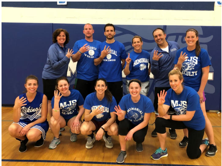
The Memorial Junior School faculty recently won the 8th Grade vs. Faculty Volleyball Tournament. The victory was Memorial Junior School faculty's fourth in a row. The tournament, which is a fundraiser for The Seeing Eye Foundation, brought in over $700. This year, 13 teams participated, including faculty teams from every one of our schools.