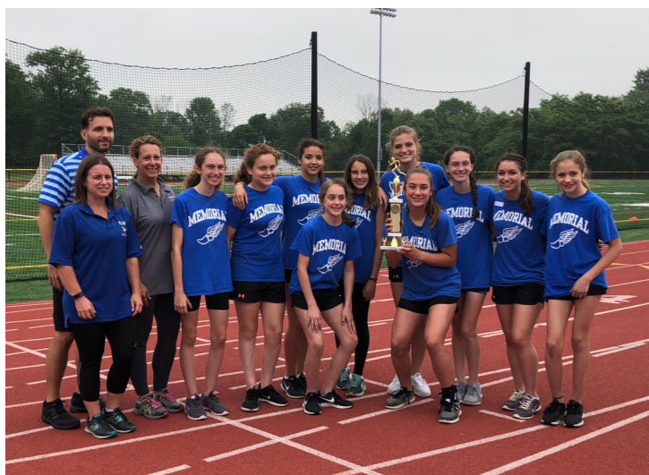
The Memorial Junior School girls track & field team had a successful season and won a number of individual events as well as the Group 1 Team Championship.