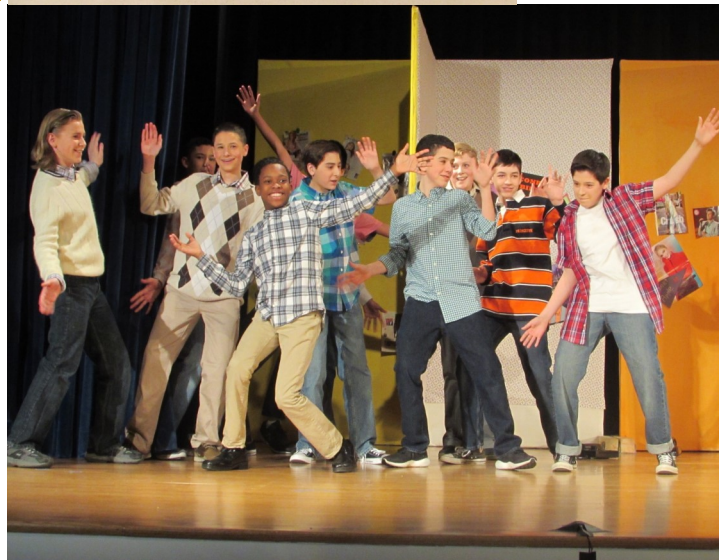
Over 125 students at Memorial Junior School were involved in this year's MJS Spring Musical, Bye Bye Birdie. The performances took place on Friday, March 23, 2018 and Saturday, March 24, 2018.