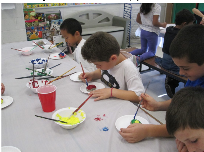
Mountview Road School students painted stones during the character education "Only One You" painting project, as part of the "Week of Respect" observance.