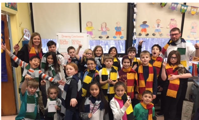
Hogwarts has come to Salem Drive School! In this Harry Potter club, wizards were sorted into Houses, created their own magical wands and potions, recited magical spells, challenged other Houses to duels, and even competed in a friendly game of quidditch.